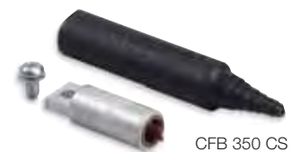
CFB 350 CS