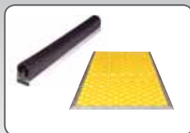
Pressure sensitive devices