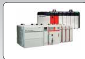
GuardLogix and Compact GuardLogix