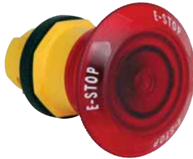
Trigger Action E-Stop Units, Illuminated