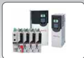
Variable speed and servo drives