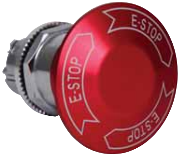
Trigger Action E-Stop Units, Non-Illuminated

The Allen-Bradley 800T/H push button product lines are designed and constructed to perform consistently in the most demanding industrial environments. This legacy of leadership continues with the introduction of the innovative 800T/H trigger action e-stop devices.