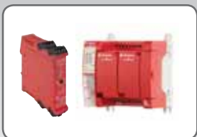
Safety relays and configurable safety relays