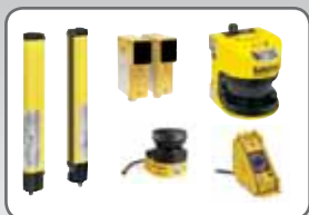
Safety light curtains, camera and scanners