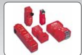
Tongue and hinge switches