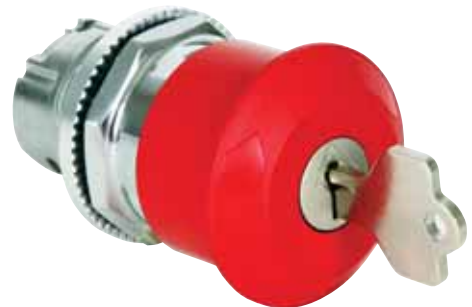
Trigger Action E-Stop Units, Key Release